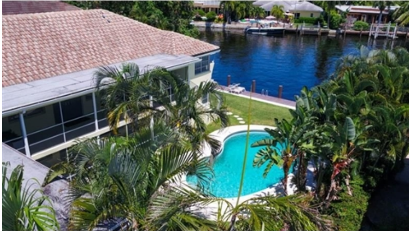
For Greater Ft. Lauderdale REALTORS® 11/13/2017 © Greater Ft. Lauderdale REALTORS® 11/13/2017